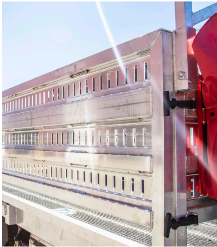
Removable aluminum side rails.