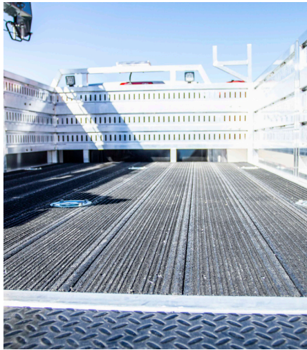
All aluminum bed and under frame for less weight and more hauling capacity. Rumbar bed floor for no slip access to the bed.