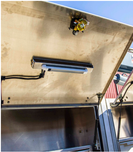
LED light in each tool box for night work.