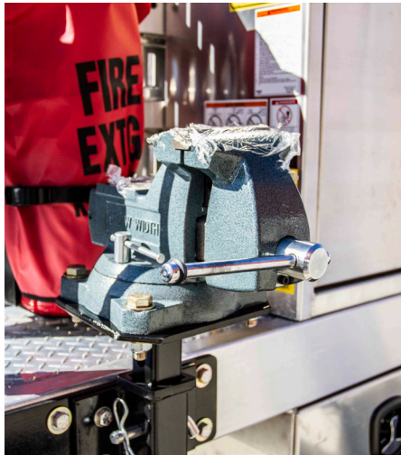
Removable pipe vice attachment.