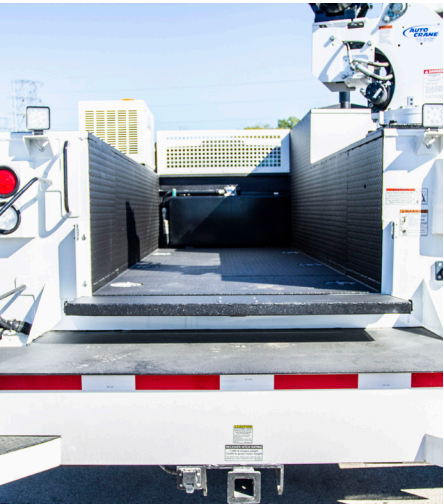
Spray-in lining material inside entire bed, top of rear bumper, wheel chock compartments, front of body splash guard and entire body undercoating