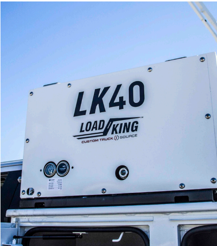
Load King LK40, 40 CFM air compressor offers up to 150 PSI w/ 22.5 gallon air tank, 1/2" x 50' hose reel kit and 1/2" moisture separator/regulator/oiler