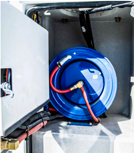
Reel-mounted air hose protected behind hinged control panel in crane compartment for maximum compartment capacity and maintenance access