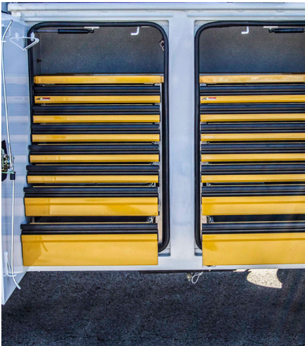
State-of-the-art aluminum CTECH drawer sets in front vertical compartments (driver side) and middle horizontal compartments