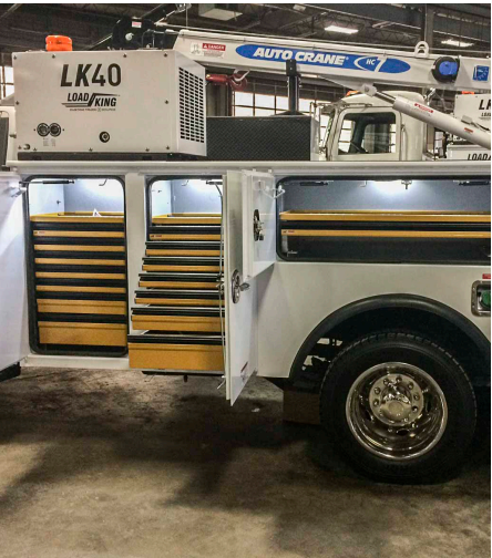
Brilliant 1400 Lumens LED body work lights, w/ swiveling, load line-following, 2600 Lumens work light on the boom, for max work area visibility